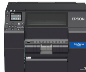
ColorWorks C6500P (C31CH77201)