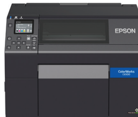
ColorWorks C6500A (C31CH77101)