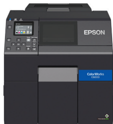
ColorWorks C6000A (C31CH76101)