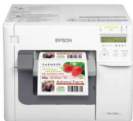
ColorWorks® C3500 (C31CD54011)