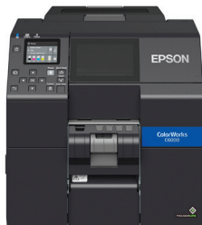
ColorWorks C6000P (C31CH76201)