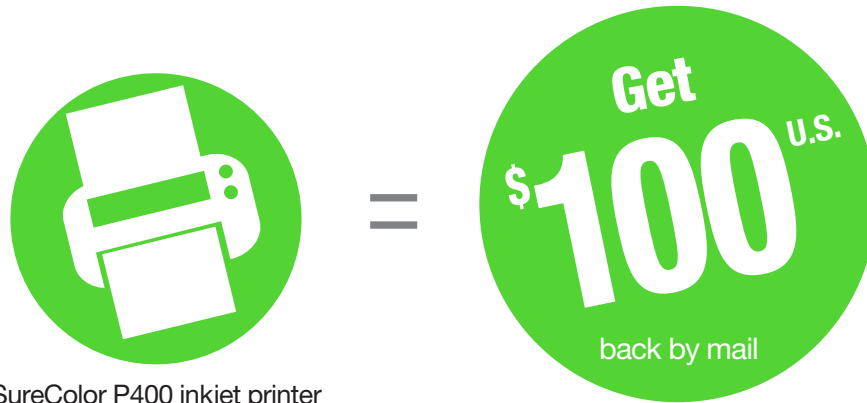
SureColor P400 inkjet printer

Purchase a SureColor ® P400 or SureColor P600 inkjet printer and receive the following back by mail: