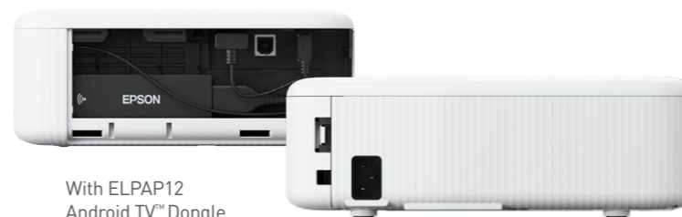
With ELPAP12 Android TV™ Dongle.

The CO-FH02 can function as a smart projector, thanks to its Chromecast built-in™ features and bundled Android TV™ Dongle. Streaming your favourite video content has never been easier!