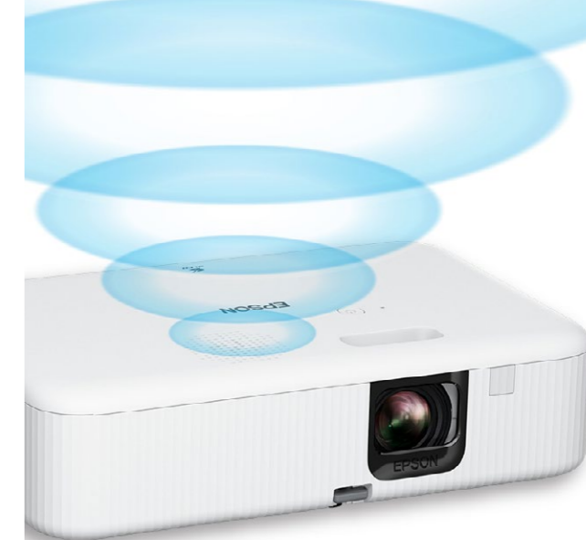
Top speaker placement for optimal sound quality.

The projector also boasts a powerful sound output of 5W and can project wirelessly. Altogether, the CO-FH02 is a well-rounded projector that provides users a multitude of visual experiences with its in-demand features which were designed to meet all of one's lifestyle needs.