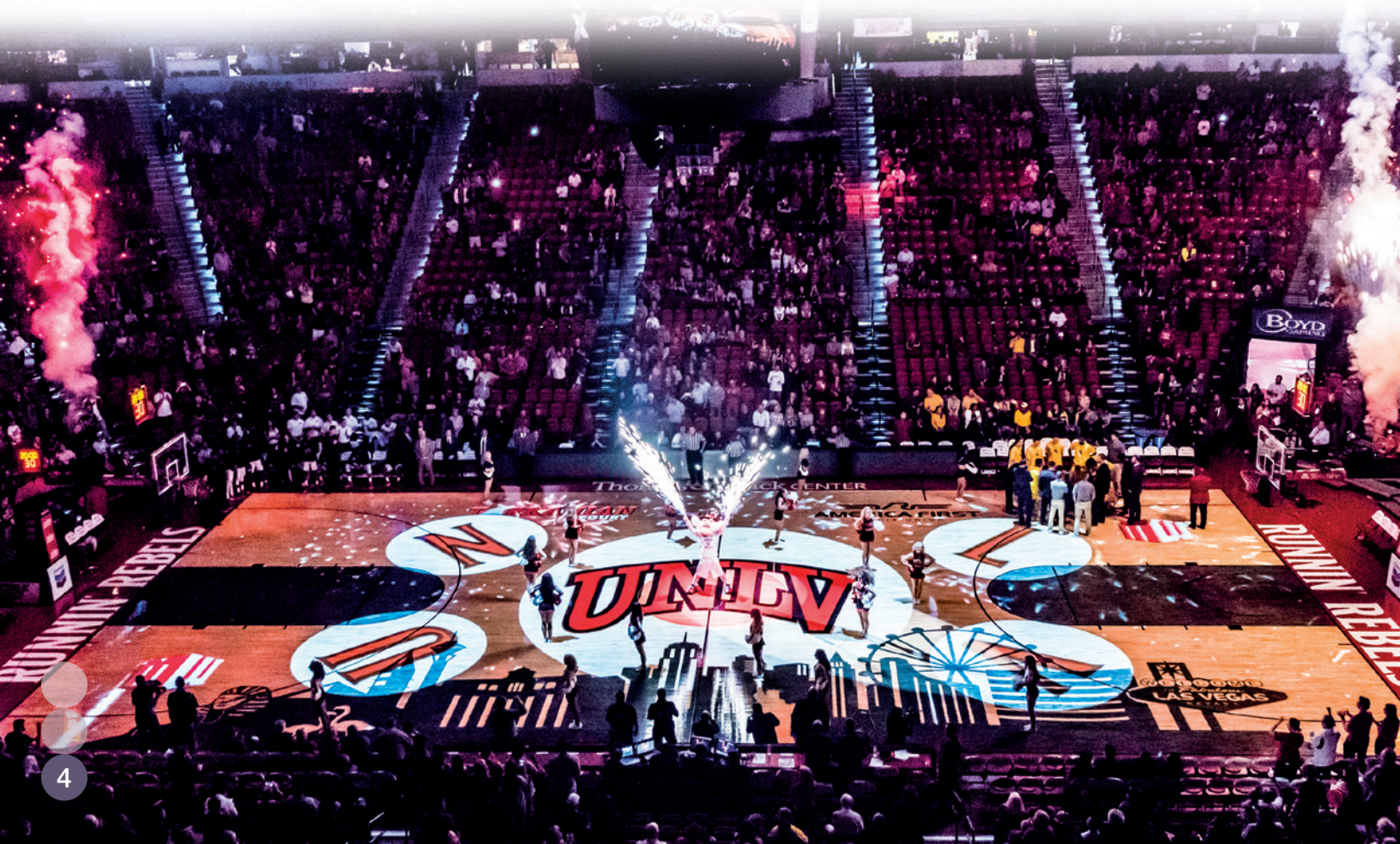
Image projected on to basketball court using Epson Pro L25000U WUXGA 3LCD laser projectors.

We understand that — just like no two students are alike — each classroom and learning environment offers a unique space for exploration and understanding. From interactive whiteboarding solutions that make collaborative, personalized learning a regular part of instruction to high-brightness, large-venue products for well-lit spaces, Epson is education's #1 choice for projection technology.