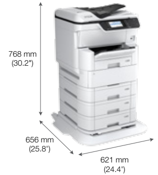
WF-C879R Weight: 75.6 kg (166.7 lb)