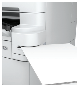
Manual Stapler* *WF-C879R only