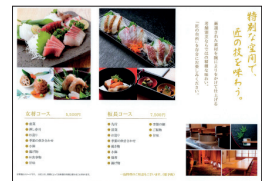
High quality Inkjet paper