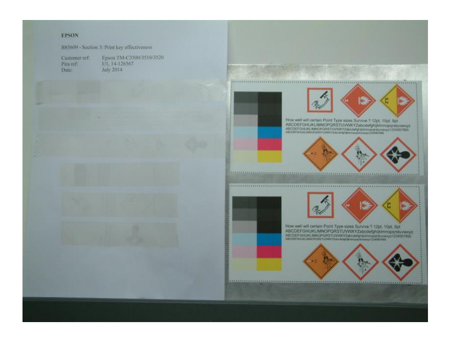
Figure 1 – Sample reference: U1 TM-C3500

Figures 1 and 2, results after adhesion test