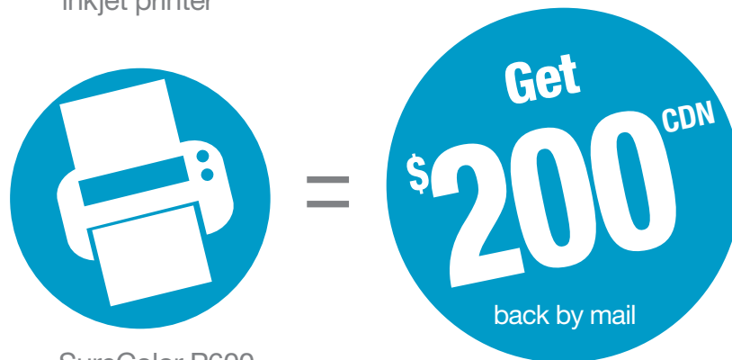
SureColor P600 inkjet printer

CLAIMS MUST BE POSTMARKED WITHIN 30 DAYS FROM THE PURCHASE DATE. PRODUCT MUST BE PURCHASED BETWEEN 11/1/16 AND 11/30/16.