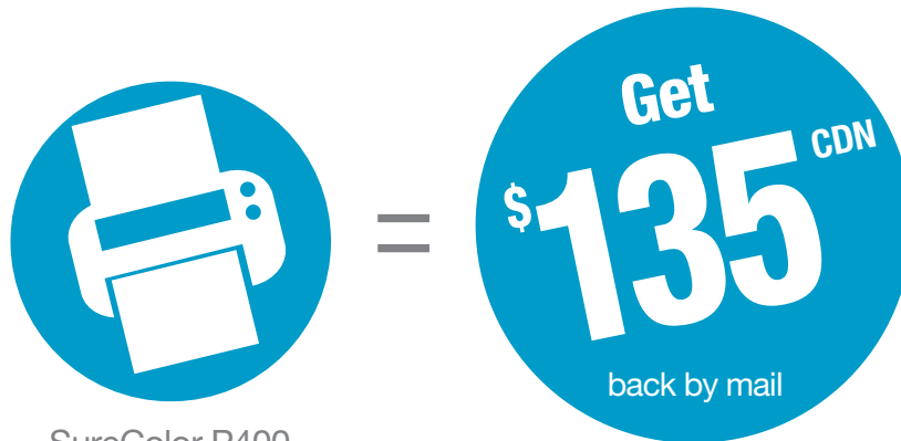
SureColor P400 inkjet printer

Purchase a SureColor® P400 or P600 inkjet printer, and receive the following back by mail: