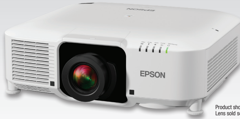
Product shown with lens. Lens sold separately.