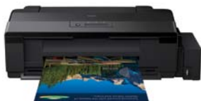
L1800 InkTank System Printer

The world's first truly affordable 6 colour A3+ original ink tank system printer, the L1800 comes with borderless printing capabilities and great colour fidelity, along with low running costs.