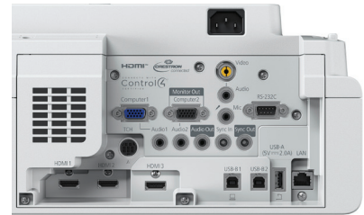
Additional USB-A port on side of display.

Features Computer, HDMI, USB, LAN, Source Search, Power, Aspect, Color Mode, Volume, E-Zoom, A/V Mute, Freeze, Menu, Auto, Enter, Esc, User, ID, Default, Home, Split