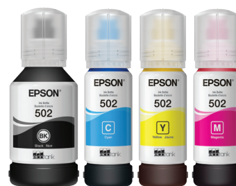
Replacement ink bottles

Designed for Reliability — Worry-free 2-year limited warranty with registration 8 , including full unit replacement