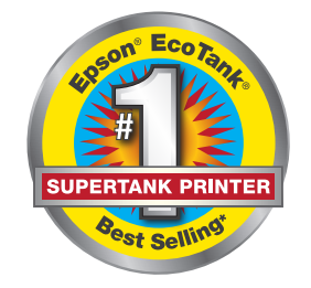
*The NPD Group, Inc., Total Channel Tracking Service, U.S. & Canada, Inkjet SF/MF Printers, Refillable ink tank included, based on units, February 2019 -January 2020. Supertank printers are defined as refillable ink tank printers.