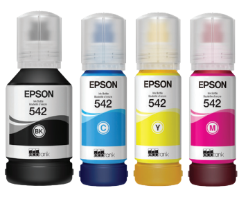
Replacement pigment ink bottles

Product protection you can count on — 2-year limited warranty with registration<sup>7</sup>, plus key security features; WPA2 for both wireless and Wi-Fi Direct<sup>6</sup>, user-initiated data erase and network protocol disablement