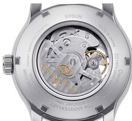
Case back with engravings (70 th anniversary limited edition and serial number)