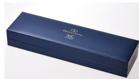
70 th anniversary box for limited edition