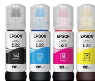
Replacement ink bottles

Designed for Reliability — Worry-free 2-year limited warranty with registration 8 , including full unit replacement