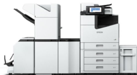
WorkForce Enterprise Multi-function Printers WF-C20600/C20750/C21000