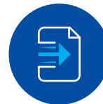
Faster First Page Out