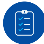
Fewer Steps & Parts