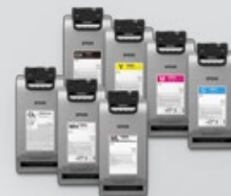
Replaceable Ink Packs (1.5 L each)