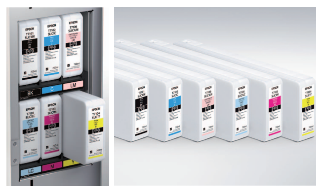
700ml ink cartridges in 6 colours: Cyan, Magenta, Yellow, Black, Light Cyan, Light Magenta

Chemical liquids and their disposal costs are eliminated through the use of environmentally friendly, high capacity and competitively priced ink cartridges that allow you to do more with your budget and for the environment. In addition, the print engine is built with durable components to support large volume commercial photo use while minimising the need for periodic part replacement.