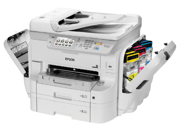
Figure 2 Less Intervention, Higher Page Yield

Easy access and less frequent replacement of high-yield ink supplies are characteristic of Epson's business-class network printers.