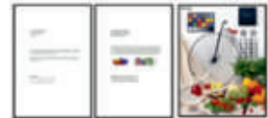
#1 Black Text #2 Colour #3 Photo 4R

1 Print speed (Pages Per Minute) is calculated when printed on A4 plain paper in the fastest mode, 10 x 15 cm photo print speed when printed on Epson Premium Glossy Photo Paper. Print speed may vary depending on system configuration, print mode, document complexity, software, type of paper used and connectivity. Print speed does not include processing time on host computer.