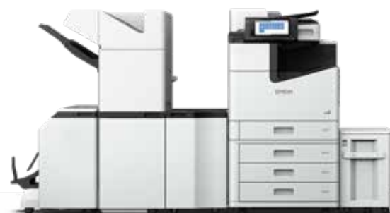
WorkForce Enterprise Multi-function Printers WF-C20600/C20750/C21000