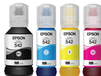
Replacement pigment ink bottles

Security features and easy connectivity — full suite of embedded features protects your data; connect wirelessly with Wi-Fi Direct® 5 ; also features voice-activated printing 6