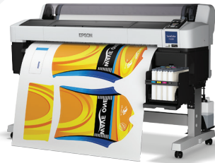
Buy an Epson SureColor F6200, F7200 or F9200 printer