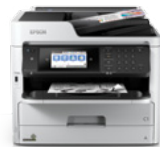
WorkForce Pro WF-M5799 Print / Scan / Copy / Fax

HIGH-VOLUME INK PACKS No Toners. No Cartridges.