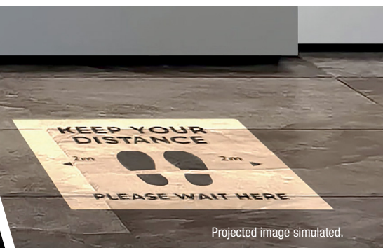
Projected image simulated.