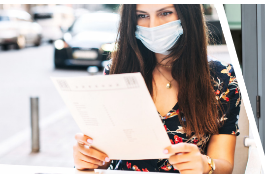
Label and Informational Single-Use Printing

Today's businesses are facing unprecedented challenges. Epson offers a wide-range of proven products that simplify addressing social distancing and customer safety-related messaging to help your business overcome these challenges. We have a variety of solutions that make it easy, from creating static signage and dynamic video communication for safety protocols, to printing disposable menus and personalized takeout labels.