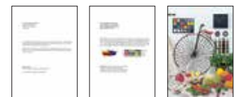
#1 Black text #2 Black text and graphics #3 Photo 4R (4 x 6")

1 Print speed (Pages Per Minute) is calculated when printed on A4 plain paper in the fastest mode, 10 x 15 cm photo print speed when printed on Epson Premium Glossy Photo Paper. Print speed may vary depending on system configuration, print mode, document complexity, software, type of paper used and connectivity. Print speed does not include processing time on host computer.