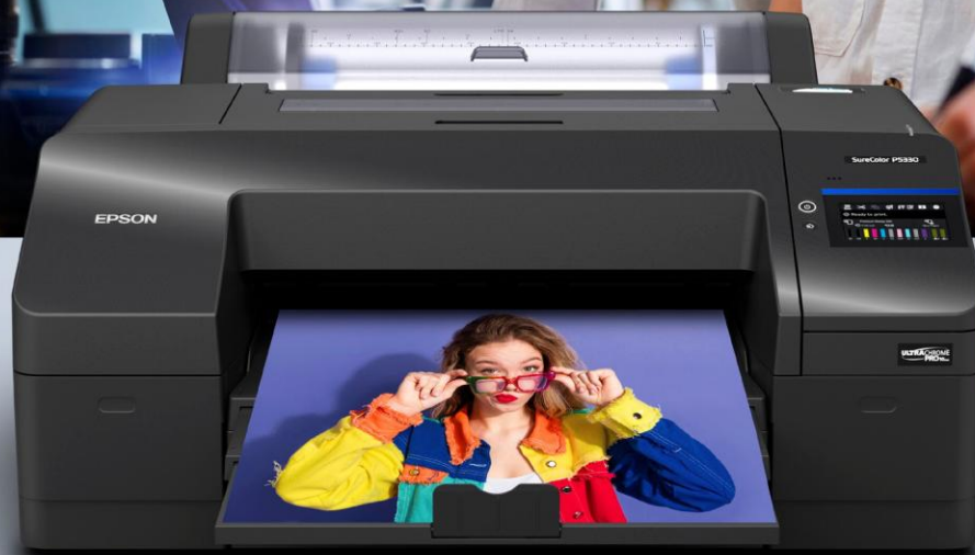
SC-P5330 17" Photo Printer

EXCEPTIONAL DEPTH AND COLOUR IN EVERY PRINT.