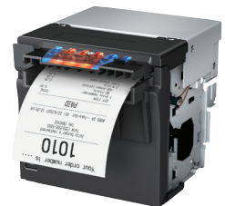
Shown with bezel (optional sold separately)

Paper-saving functions — reduce paper usage by up to 30% 2