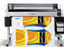
SC-F6270 44" Wide Dye-Sub