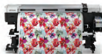
SC-F7270 64" Wide Roll-to-Roll Dye-Sub