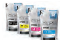
High capacity 1L ink packs.