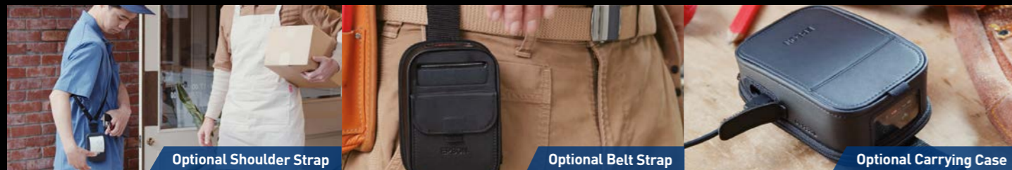
Optional Shoulder Strap