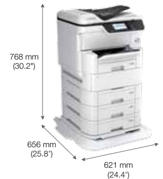
WF-C879R Weight: 75.6 kg (166.7 lb)