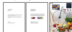
#1 Black Text #2 Colour #3 Photo 4R

1 Print speed (Pages Per Minute) is calculated when printed on A4 plain paper in the fastest mode, 10 x 15 cm photo print speed when printed on Epson Premium Glossy Photo Paper. Print speed may vary depending on system configuration, print mode, document complexity, software, type of paper used and connectivity. Print speed does not include processing time on host computer.