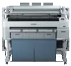
Multifunction Graphics Printers

Offering outstanding value, advanced print management and security features, and easy wireless integration, Epson's letter-size and wide-format single-function and multifunction printers reduce overall costs and improve efficiencies. Ideal for use in libraries and resource centres, administrative offices, labs, and more, this innovative lineup — including Epson's groundbreaking WorkForce® Enterprise printer and Replaceable Ink Pack System (RIPS) printers — delivers ultra high-speed, affordable colour printing without sacrificing quality.