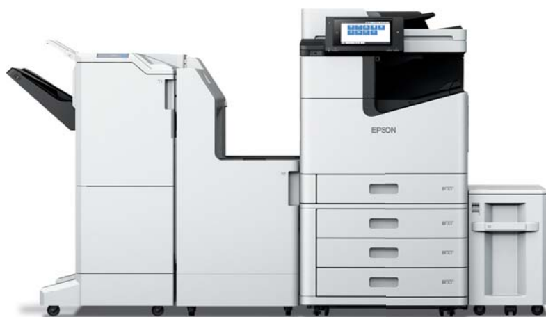
Shown with optional accessories (sold separately).