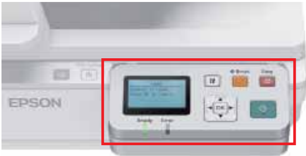
Easy navigation of job settings with LCD panel on network interface panel.

With optional network interface panel, scanners can be shared amongst a work group without the need for USB connections. Users can easily select desired PC within the network via Document Capture Pro application installed on Client or Server PC.