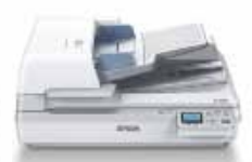
DS-70000 Flatbed with ADF 70ppm/140ipm