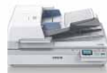
DS-60000 Flatbed with ADF 40ppm/80ipm