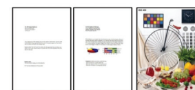
#1 Black text #2 Colour #3 Photo 4R

*1 Print speed (Pages Per Minute) is calculated when printed on A4 plain paper in the fastest mode, 10 x 15 cm photo print speed when printed on Epson Premium Glossy Photo Paper. Print speed may vary depending on system configuration, print mode, document complexity, software, type of paper used and connectivity. Print speed does not include processing time on host computer.