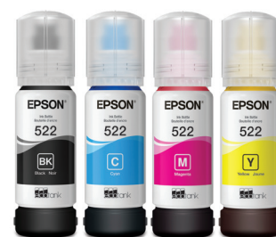
Replacement ink bottles

Designed for Reliability — Worry-free 2-year limited warranty with registration 8 , including full unit replacement