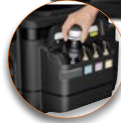
Easy-to-fill, supersized ink tanks for cartridge-free printing