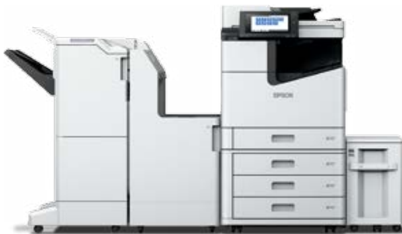
Shown with optional accessories (sold separately).