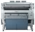
Multifunction Graphics Printers

Offering outstanding value, advanced print management and security features, and easy wireless integration, Epson's letter-size and wide-format single-function and multifunction printers reduce overall costs and improve efficiencies. Ideal for use in libraries and resource centers, administrative offices, labs, and more, this innovative lineup — including Epson's groundbreaking WorkForce® Enterprise printer and Replaceable Ink Pack System (RIPS) printers — delivers ultra high-speed, affordable color printing without sacrificing quality.