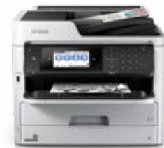
WorkForce Pro WF-M5799 Print / Scan / Copy / Fax

HIGH-VOLUME INK PACKS No Toners. No Cartridges.