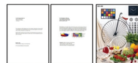
#1 Black text #2 Colour #3 Photo 4R

*1 Print speed (Pages Per Minute) is calculated when printed on A4 plain paper in the fastest mode, 10 x 15 cm photo print speed when printed on Epson Premium Glossy Photo Paper. Print speed may vary depending on system configuration, print mode, document complexity, software, type of paper used and connectivity. Print speed does not include processing time on host computer.