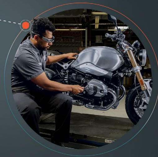
FIELD PERSONNEL Head up, hands free