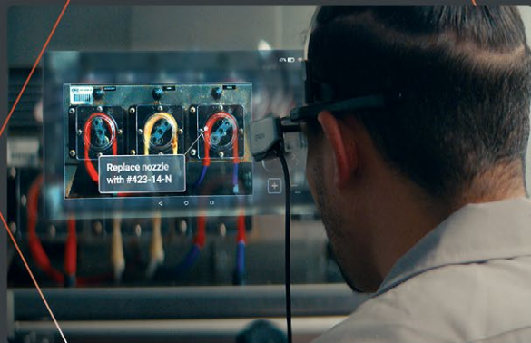
Projected image simulated

By enabling real-time collaboration between remote experts and field personnel wearing the glasses, Moverio Assist helps users make repairs quicker with fewer mistakes, leading to increased productivity, improved customer satisfaction and reduced travel costs.