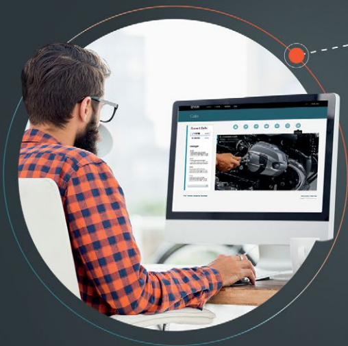
REMOTE EXPERT "See-what-I-see" Experience