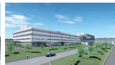
Proposed Textile Solution Center in Hirooka, Japan