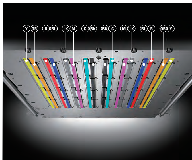
Symmetrical color alignment for high-quality bidirectional printing

Symmetrical color alignment ensures consistent color overlap order is maintained during bidirectional printing. As a result, color and pattern reproduction are exceptionally uniform, and even areas of solid color and fine geometric patterning can be beautifully rendered while maintaining high throughput.