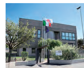
Textile Solution Center in Como, Italy

At our Textile Solution Center in Como, Italy, and at a new center slated to open in Japan in 2020, we offer a full range of consulting and support services. From equipment demos and sample production, to advice on pre and post-processing techniques, we provide full service support for every stage of the fabric printing process.