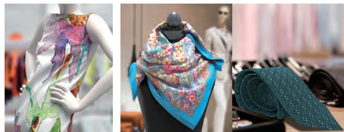
Reactive ink on cotton

Superior printhead positioning accuracy and ink droplet control ensure excellent thin line reproduction and edge sharpness, with improved grain on lighter colors. And whatever the fabric or design, GENESTA inks can accurately render everything from delicate hues to bold, bright colors.