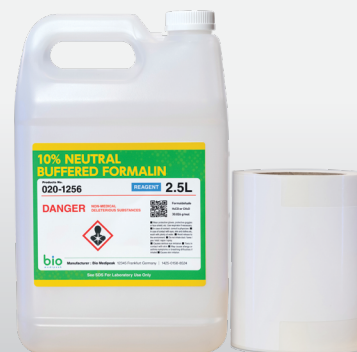
Hi-Res Color and Variable Data Printed in One-Step