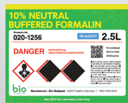
Two-Step Label with Potential for Misalignment