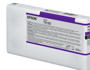
Violet Pigment Ink