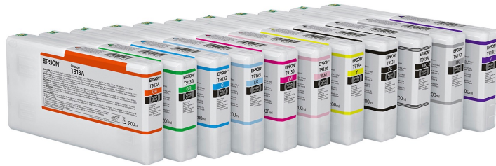
200 ml UltraChrome HDX Ink Cartridges Commercial Edition ink set shown (80 ml initialization ink cartridges in-box)