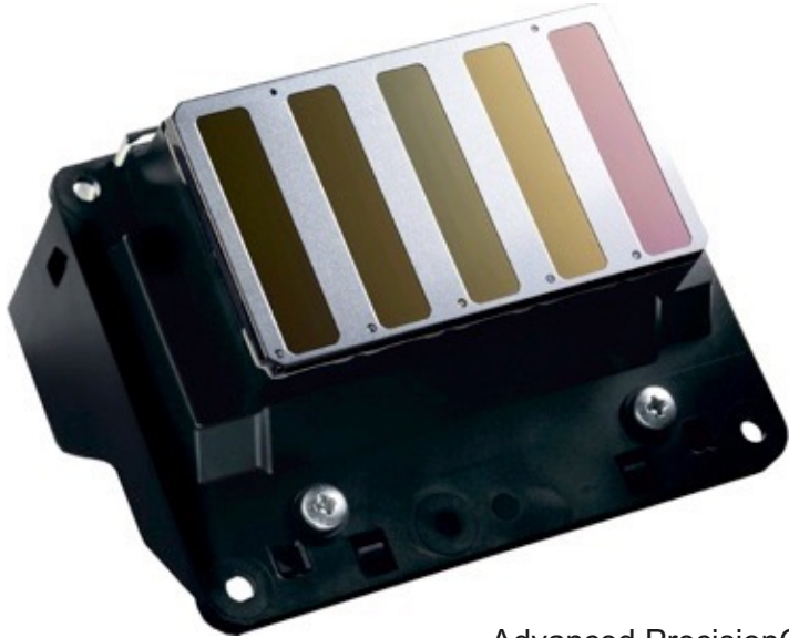
Advanced PrecisionCore TFP Printhead