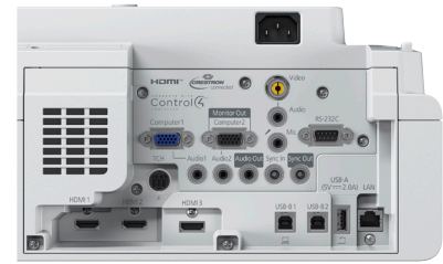
Additional USB-A port on side of display.

Features Computer, HDMI, USB, LAN, Source Search, Power, Aspect, Color Mode, Volume, E-Zoom, A/V Mute, Freeze, Menu, Auto, Enter, Esc, User, ID, Default, Home, Split Operating Angle Rear: Right/Left: -55 to +55 degrees, Upper/Lower: +75 to +15 degrees Front: Right/Left: -30 to +30 degrees, Upper/Lower: 0 to +60 degrees Operating Distance 19.7 ft (6 m)