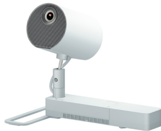
LightScene EV-110 shown with optional Floor Stand, sold separately.

LightScene EV-110 V11HA22020 Lighting Track Mount (ELPMB66W) V12HA32020 Floor Stand (ELPMB55W) V12H888W10