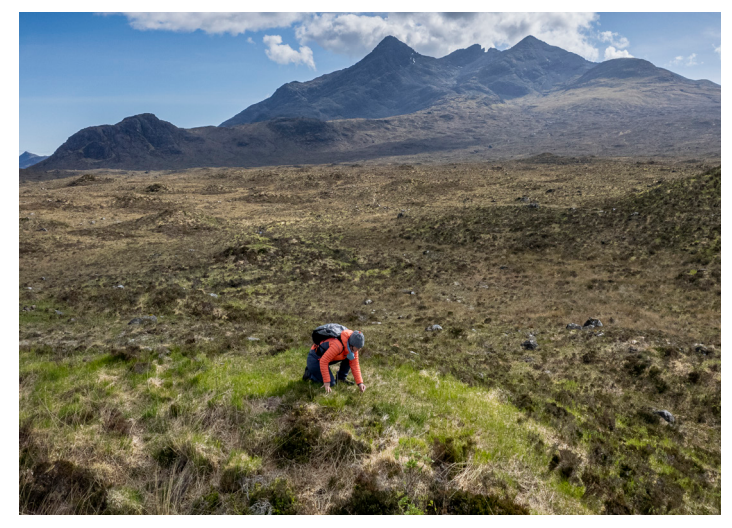
"Tundra ecosystems are towards the climate extremes of life on the planet," Myers-Smith says. Understanding what strategies plants here use to live in harsh conditions, and how adaptable those strategies are "helps predict what's going to win out as the climate changes and what's going lose."

But the fact that these noticeable impacts are happening regionally doesn't mean that those of us who don't live in this landscape can ignore what's happening.