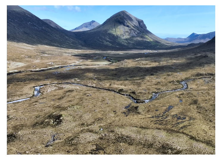
Watch Myers-Smith and her team work in one of the world's disappearing tundra patches: the Cairngorm Mountains of Scotland. Video by National Geographic CreativeWorks