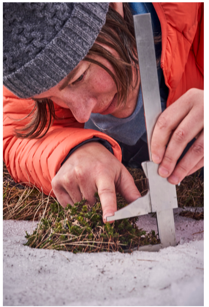
Measuring the area of individual leaves is one way to understand how a certain plant functions in an ecosystem. How it captures sunlight and water, what happens to the leaf when it falls off, and how fast it decomposes all have implications for changing ecosystems.