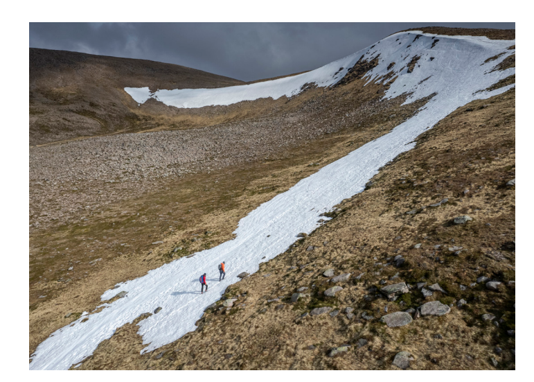
The greening of the tundra might seem like a localized impact of a warming planet, but it has far-reaching implications. Our individual actions can help mitigate climate change and slow warming in the Arctic and hence the rest of the world.