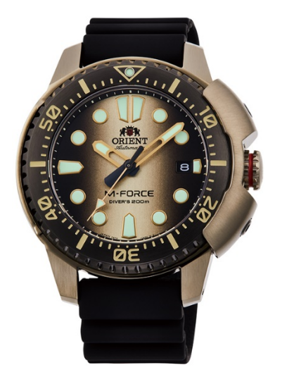
RA-AC0L05G 1,600 limited editions