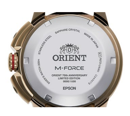
Case back with engravings