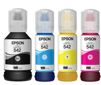
Replacement pigment ink bottles

Security features and easy connectivity — full suite of embedded features protects your data; connect wirelessly with Wi-Fi Direct<sup>®6</sup>; also features voice-activated printing<sup>7</sup>