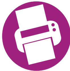
SureColor P800 Screen Print Edition (SCP800SP) printer

Purchase a qualifying SureColor® Screen Print Edition printer and receive two rolls of Epson® Screen Positive Film media by mail.